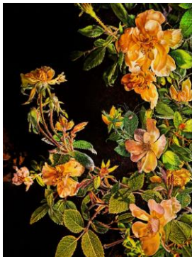
Vintage Golden Roses