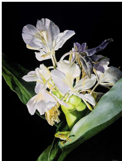
Ginger and Roger oil on canvas 36" x 48" $8500