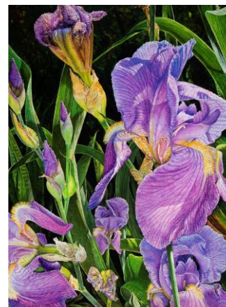
Purple Iris Family oil on canvas 30" x 40" $7700