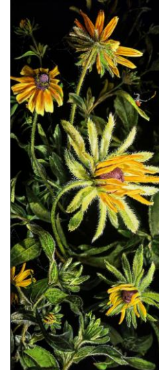
Rudbeckia Daisies oil on canvas 17" x 40" $4500