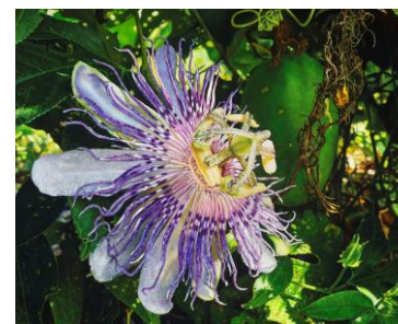
Passion Flower & Fruit oil on canvas 40" x 32" $7900