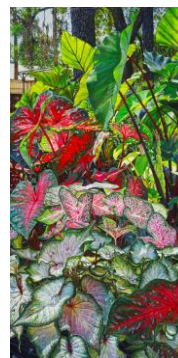
Caladium oil on canvas 36" x 18" $4500