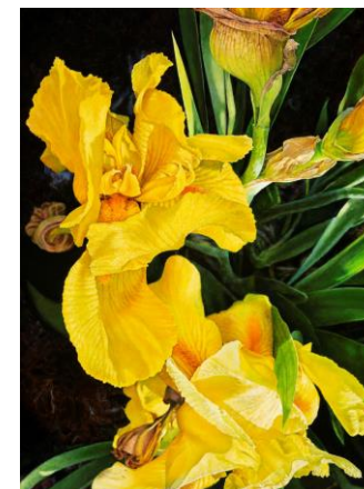
Large Yellow Iris oil on canvas 30" x 40" $7700