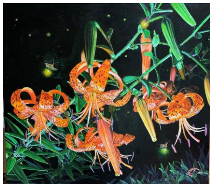
Tigers on Fire oil on canvas 32" x 36" $6700