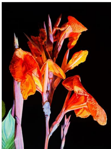
Giant Cannas oil on canvas 36" x 48" $8500