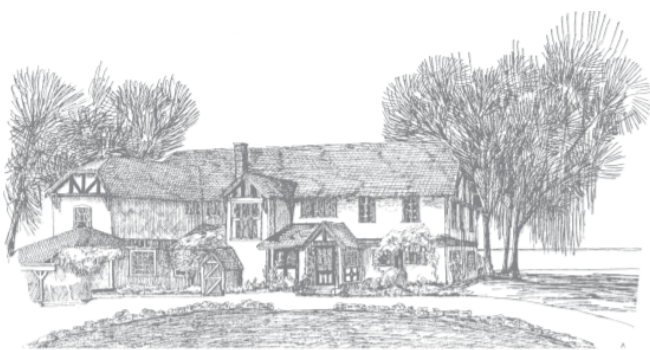
Hotel Eldorado circa 1950 Sketch by Dorothy Zoellner