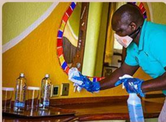
Cleaning of surface areas

SAFARI LODGES AND CAMPS HOTELS • RESORTS