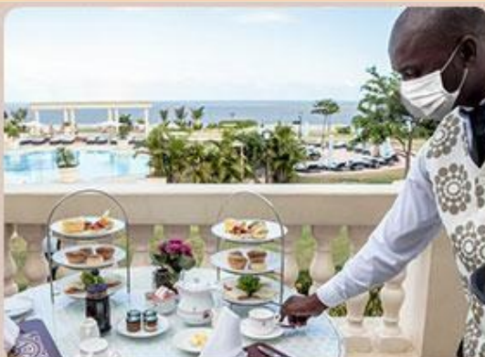
Food and beverage areas