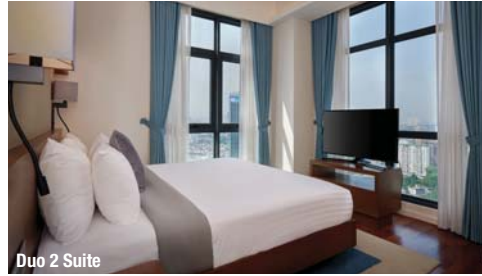
Duo 2 Suite