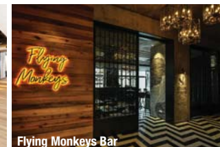
Flying Monkeys Bar