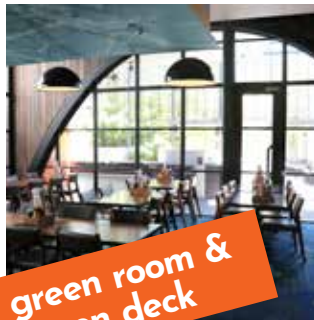
green room & green deck

For the best of both worlds, a Green Room Party can extend out onto the 'Green Room Deck' for combined inside-outside festivities. This also includes a private section of the bar to keep the good times flowing!