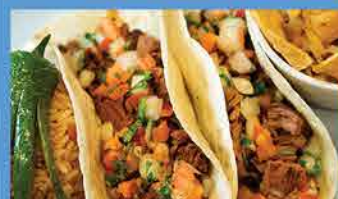
Taco Tuesdays 5.99