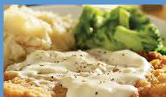
Country Fried Steak 6.99