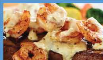
Steak & Shrimp Scampi 9.99