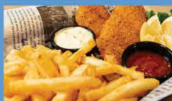
Walleye Wednesday 7.99