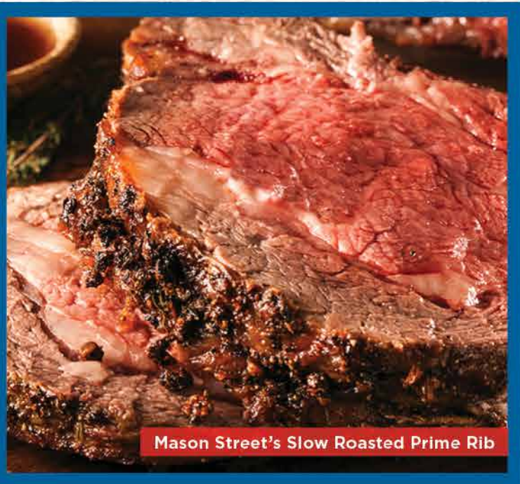
Mason Street's Slow Roasted Prime Rib