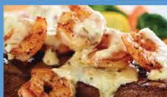
Steak & Shrimp Scampi 9.99