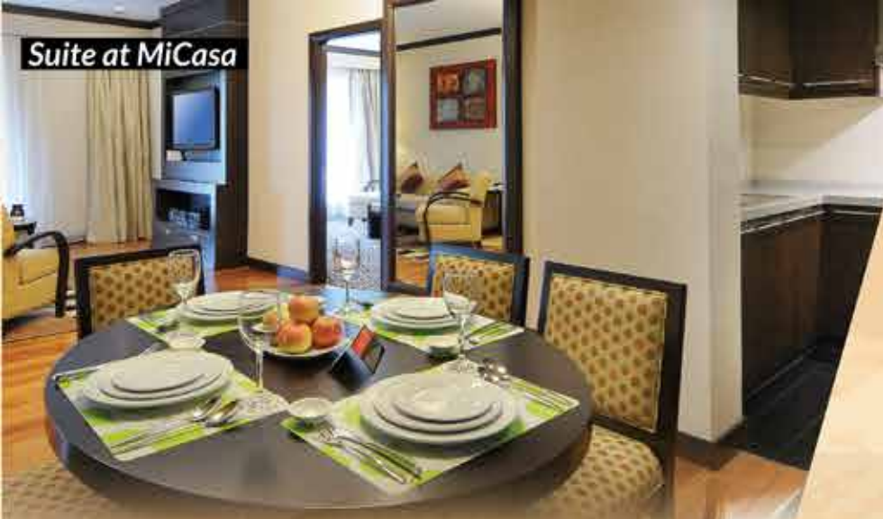
Suite at MiCasa